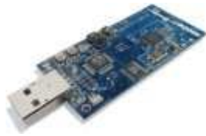
Figure 1: A Tmote Sky board is useful but working with the simulators also possible, except for the final exercise.

course in case you do not have any with you.